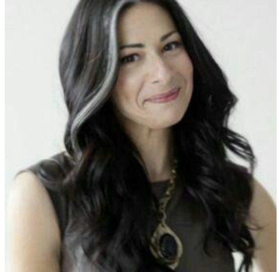
HAIR BLAZE (BLACK OR WHITE STREAK): DOMINANT → PRESENCE OF A PATCH OR STREAK