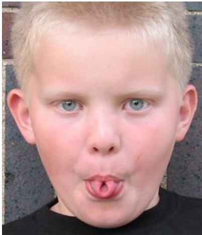
TONGUE ROLLING: DOMINATE → U-SHAPE CURVE