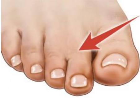
BIG TOE: DOMINATE → BIG TOE IS SHORTER THAN 2 ND TOE