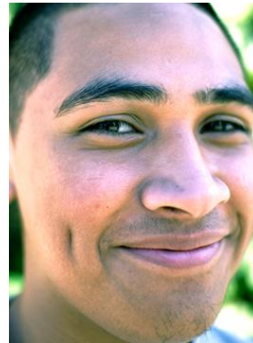
DIMPLES: DOMINATE → HAVING FACIAL DIMPLES