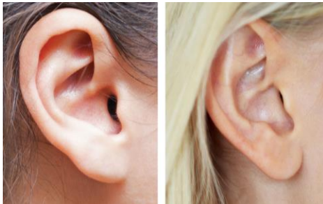
EAR LOBE: DOMINATE → PENDULOUS LOBES