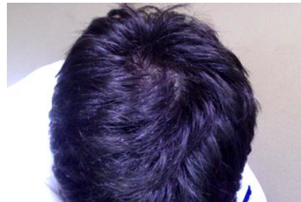
HAIR WHORL: DOMINATE → CLOCKWISE TURNS