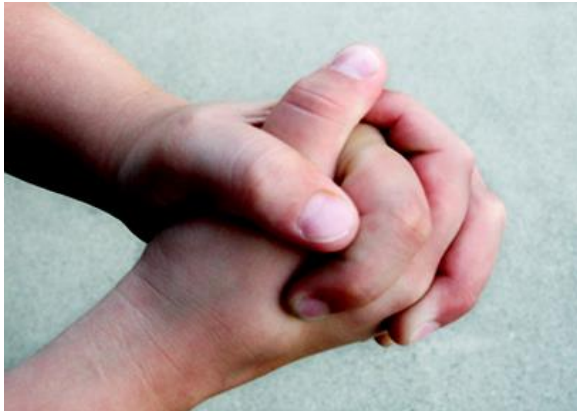
INTERLOCKING FINGERS: DOMINATE → LEFT THUMB ON TOP