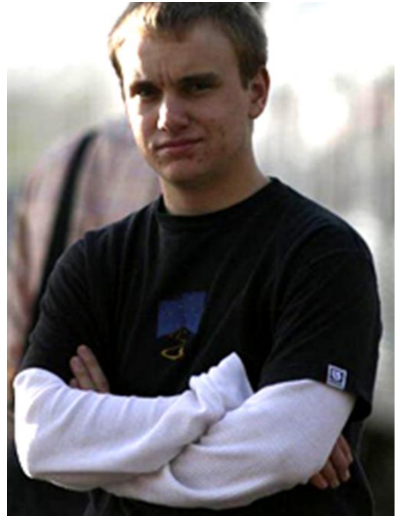
ARM FOLDING: DOMINATE → LEFT ARM OVER RIGHT ARM