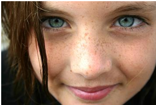
FRECKLES: DOMINATE → HAVING FACIAL FRECKLES