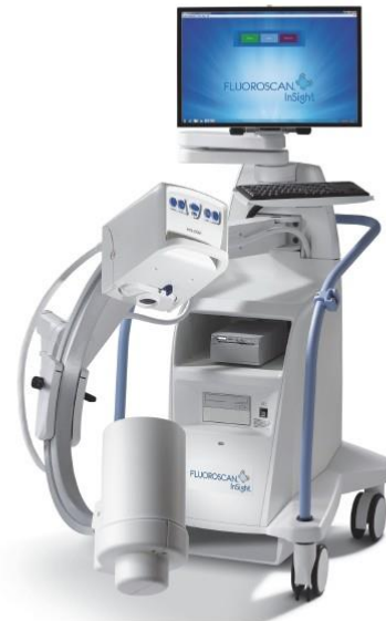
InSight™ 2 Mini C-arm User Guide MAN-04857 Revision 005